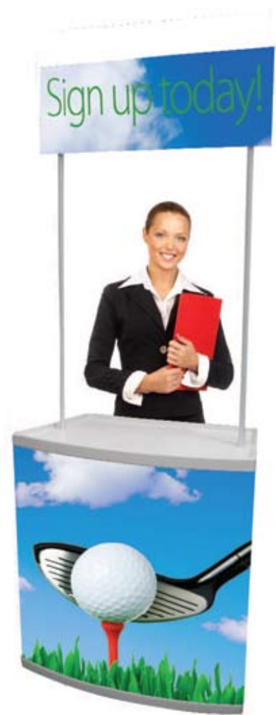
Image demonstrates the location of the graphics

* illustration only. - Actual unit may differ slightly.